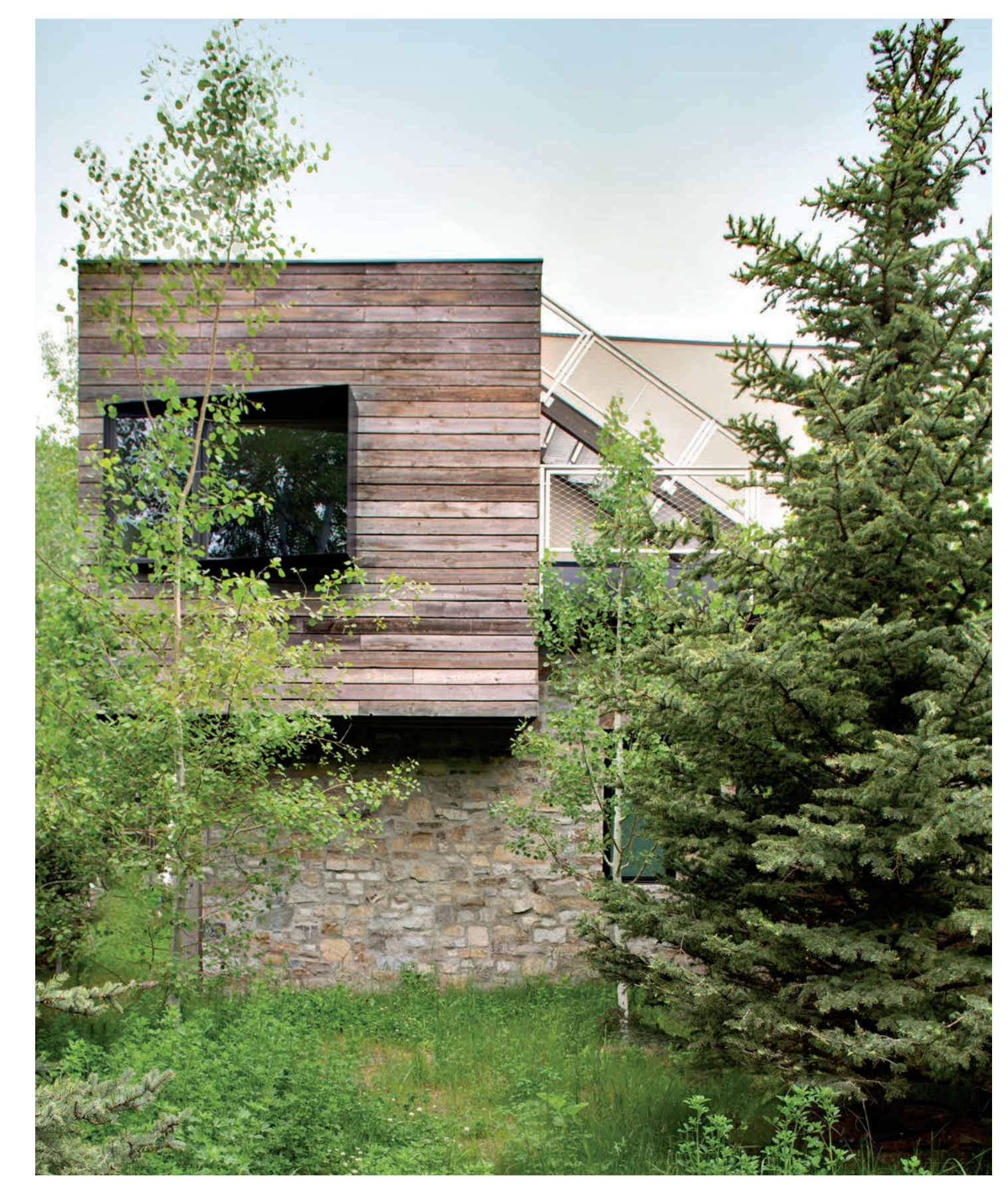
Through an asymmetric window, the homeowners can glimpse skiers come winter while soaking in their primary bathroom tub. A mixed-stone base helps anchor the residence to the land.

"I sought out furniture that could envelop you in a 'yummy' feeling," she shares. "And our focus was always to make the most of those big views." The result has brought her clients a sense of contentment. "It's very peaceful, quiet and beautiful," the husband says. "That was our vision for this house—and it just worked."