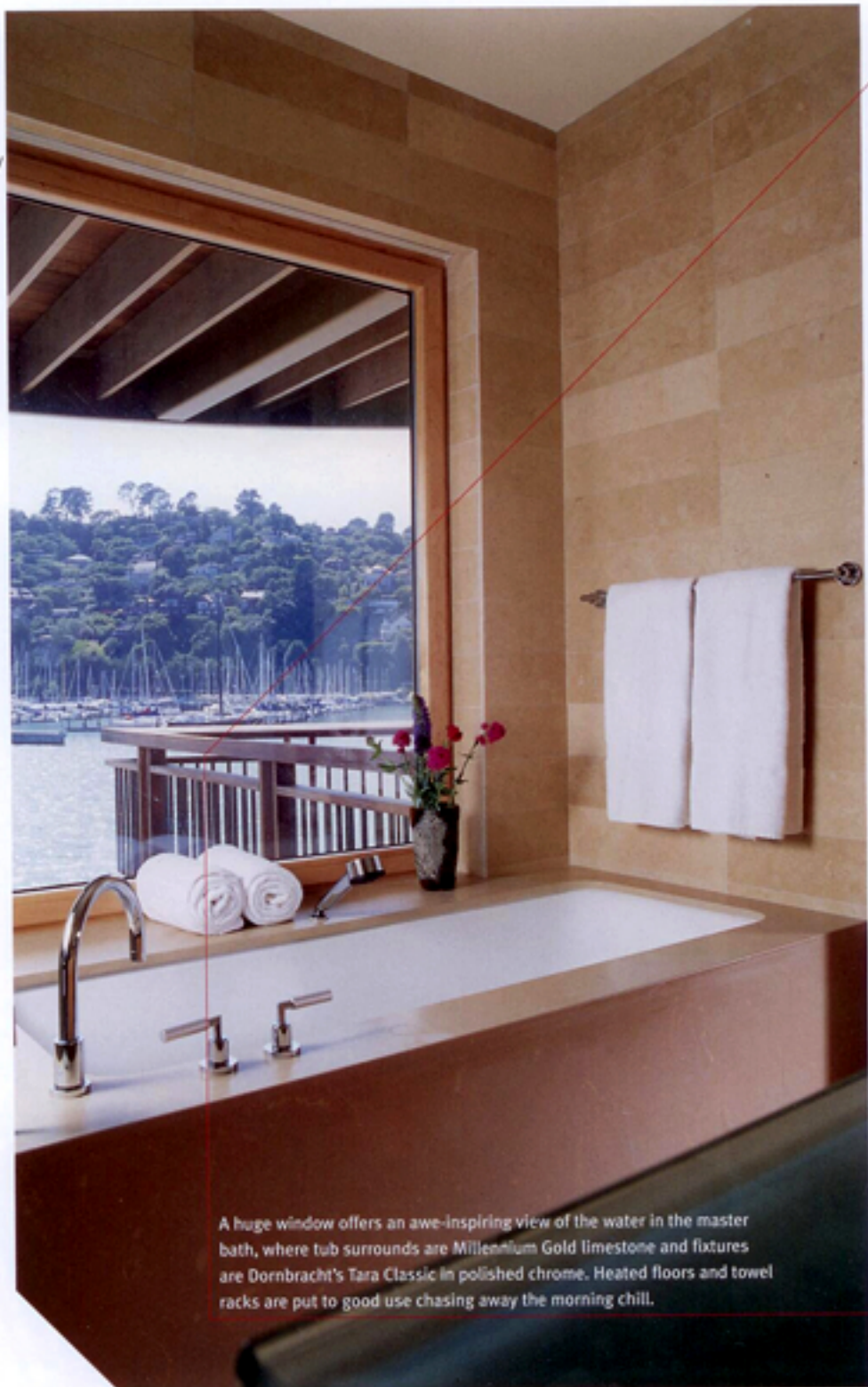
A huge window offers an awe-inspiring view of the water in the master bath, where tub surrounds are Millennium Gold limestone and fixtures are Dornbracht's Tara Classic in polished chrome. Heated floors and towel racks are put to good use chasing away the morning chill.

Sonoma Cast Stone 1741 Morningside Mountain Rd. Glen Ellen (707) 939-9929 www.sonomastone.com