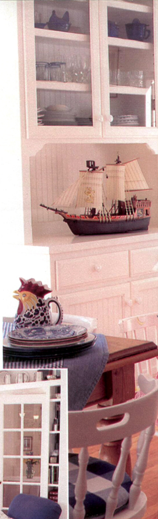
REGIONAL CONTRIBUTOR: HELEN HEITKAMP